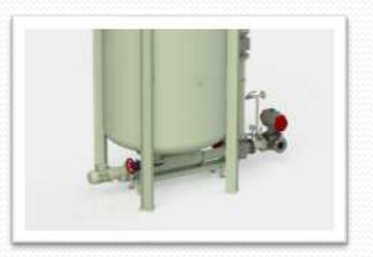
Automatic valves, suitable for food waste slurry, to allow several settings for FW transport and circulation (to prevent settling).

Sturdy food waste pumps to circulate and transport FW slurry.