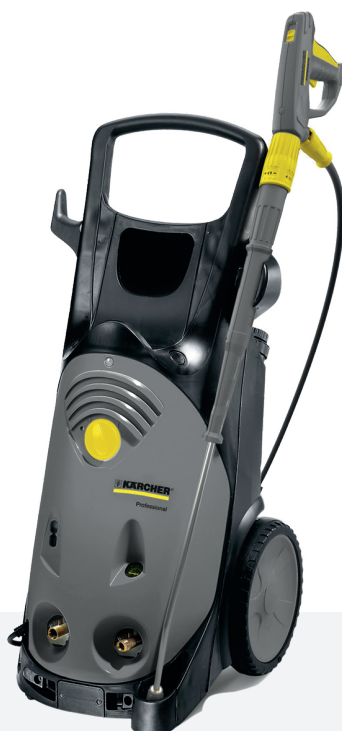
High pressure cleaner Compact class

High-pressure hose m 10 / m 20/ m 30 Premium quality High-pressure hose connector Dirt Blaster Nozzle Triple Nozzle