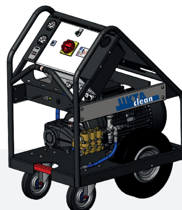
High pressure cleaner Premium class

High-pressure hose m 10 / m 20/ m 30 Premium quality High-pressure hose connector Dirt Blaster Nozzle Nozzle