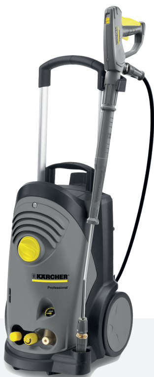
High pressure cleaner Compact class